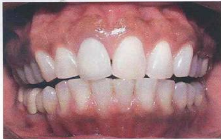
Fig 4 Intraoral preoperative view of case 2. The patient was unhappy with her smile due to the extensive pigmentation of her maxillary gingiva.