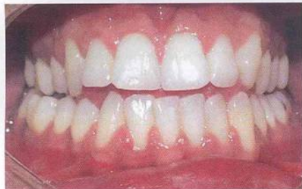
Fig 3 Intraoral 6-month postoperative view of case 1.