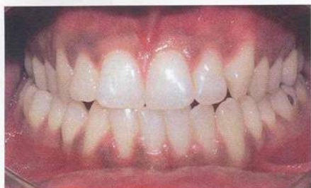
Fig 1 Intraoral preoperative view of case 1. The patient complained about the color of his anterior gingiva.