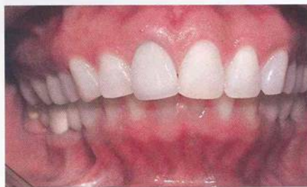
Fig 6 Intraoral 6-month postoperative view of case 2.