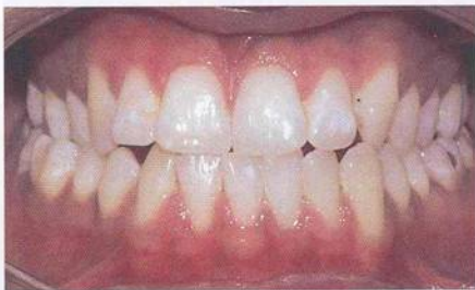
Fig 2 Intraoral 4-day postoperative view of case 1.