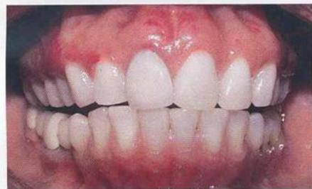
Fig 5 Intraoral 4-day postoperative view of case 2.